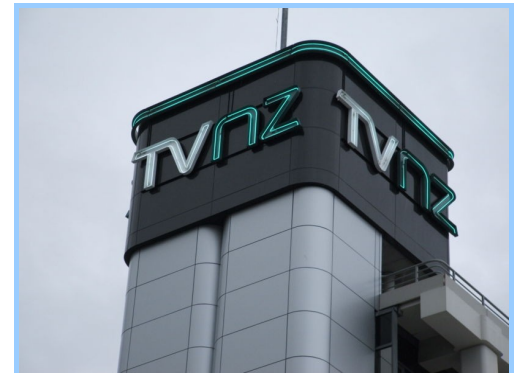
TVNZ's headquarters in Auckland, New Zealand.

The New Zealand Herald is currently also looking at reducing staff numbers by outsourcing their sub-editors/copy editors.